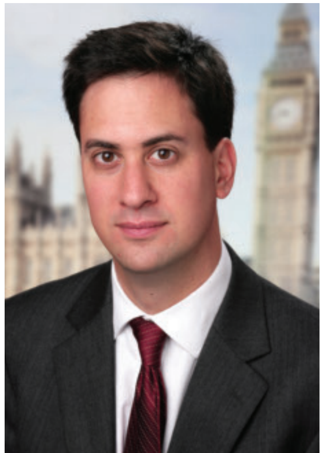
Ed Miliband MP, Minister for the Third Sector